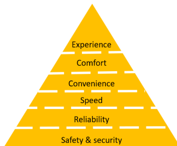
Figure 3.1: Six levels of the Bicycle Pyramid

The Bicycle Pyramid 2 , a tool for cycling policy, is derived from Maslov's Pyramid, and defines a series of 'cycling needs' that need to be fulfilled in order for people to start cycling (first three levels) or to increase the amount of cycling (last three levels). This is shown in figure 3.1.